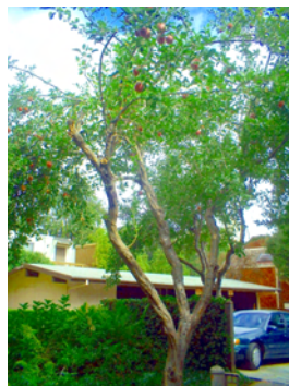
Apple tree behind Memorial Garden

The apple tree is bearing fruit right now. Bring a picker and gather some STA apples for your table.