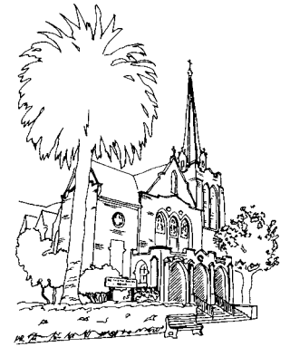
St. Thomas Aquinas Church

Enjoy strawberries and champagne and the company of fellow parishioners in the lovely circle of the Memorial Garden, directly adjacent to the church at 751 Waverley Street. All are invited to attend.