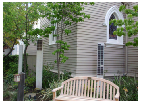
Memorial Garden remembrance plaques and bench

We have a landscape plan for this plot of bare ground, thanks to parishioner/landscape designer Deke Rowell. Now we need a team to organize the planting. Budget is approved. Please step forth and help make this happen!