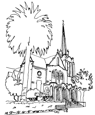
St. Thomas Aquinas Church