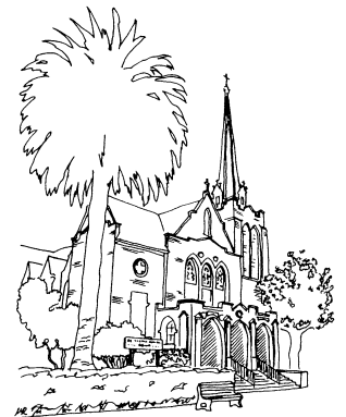
St. Thomas Aquinas Church

A tentative time line [see page 2] for implementation of the renovation has been suggested by a consulting architect (Lee Lippert). It takes into account the lead time necessary to get the various permits required. Serious consideration has already been given to the advantages possible if the Project Team applies to the City of Palo Alto for historic status for the house. Selection of the project architect is another step, and one that could involve the Diocese of San