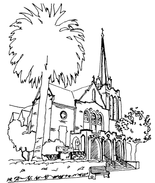
St. Thomas Aquinas Church

If final approval is obtained, as expected, it will mean that some parts of the renovation project can be done more easily and substantially less expensively. For example, we plan to renew all Thomas House's electrical wiring, and the standard building code requires that such new wiring be attached to the vertical studs in the walls. Usually, this would mean opening up the walls for several feet at each outlet, creating a big job of patching afterwards -- costly, and hard to do so it doesn't show. In contrast, the relaxed building code that can be used in historically-registered build-