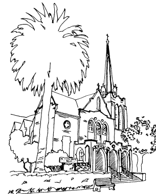
St. Thomas Aquinas Church